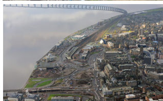
Dundee Central Waterfront Infrastructure Project. Excellent (78.5%) Construction Only Award.