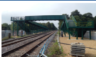
GNGE Alliance ECML Capacity Relief Project. Excellent (78.4%) Construction Only Award