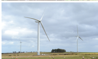
Project Maestro - 5 Whole Team Awards for 5 Wind Farm Projects